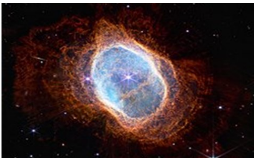
A picture of the NGC 3132 (Southern Ring) planetary nebula. This planetary nebula is approximately 2,500 light-years away.

In collaboration with the Institute for Research in Schools, Year 12 Physics students have recently taken part in two cutting edge physics research projects. The first project involved students learning how to accurately identify distinct types of stars using light collected from the Spitzer Space Telescope.